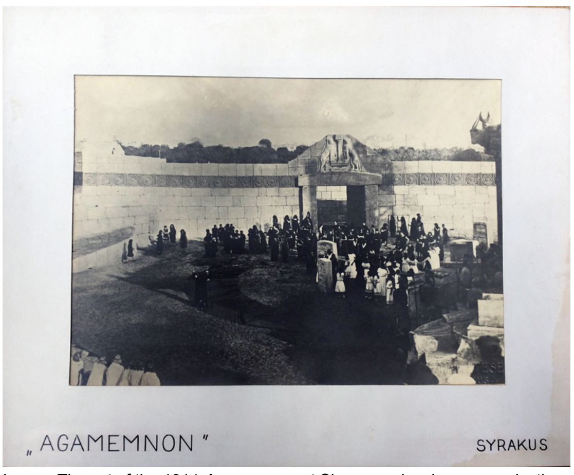
Image: The set of the 1914 Agamemnon at Siracusa, showing a reproduction of the Lion Gate of Mycenae above the entrance.