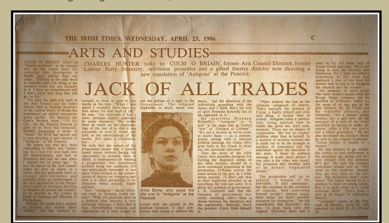
Review of the 1986 Antigone in the Irish Times .

have no wish to do it again. So, I have never repeated myself in that regard. I mean, other directors take the same play and do several productions of it with different actors, at different times. I have never been in that situation.